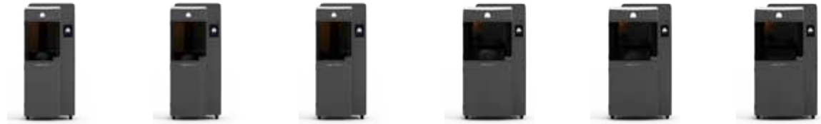
ProJet 6000 SD ProJet 6000 HD ProJet 6000 MP ProJet 7000 SD ProJet 7000 HD ProJet 7000 MP

Extend Innovation. Extend Production. Extend Choices.